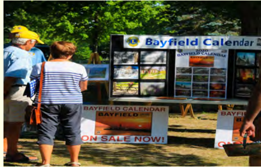
The Bayfield Lions Club and Bayfield Photography Club 2020 Calendar is available NOW!