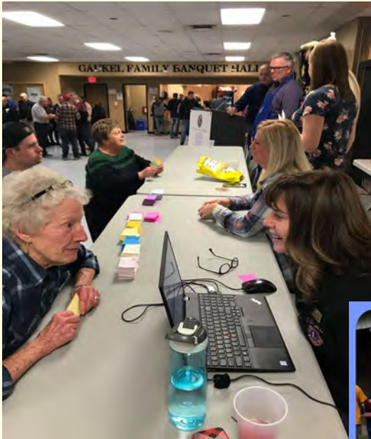
St. George Lions Turkey Roll a huge success.