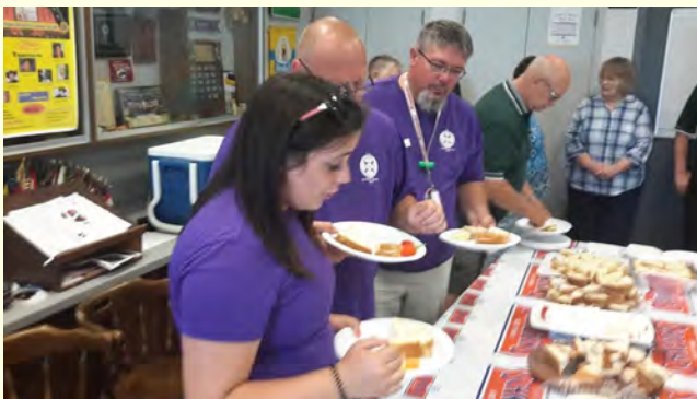
Oktoberfest Lions feeding the Youth Group from around the world.