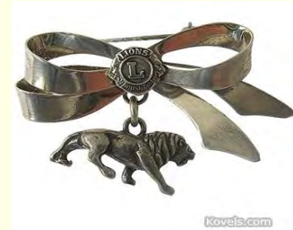
Early LC Fraternal Club Pin

one reason or another, i.e. Lion's Districts, individual clubs and personally designed pins for individuals. The number of pins produced each year is not known, but it is safe to say there are thousands produced collectively.