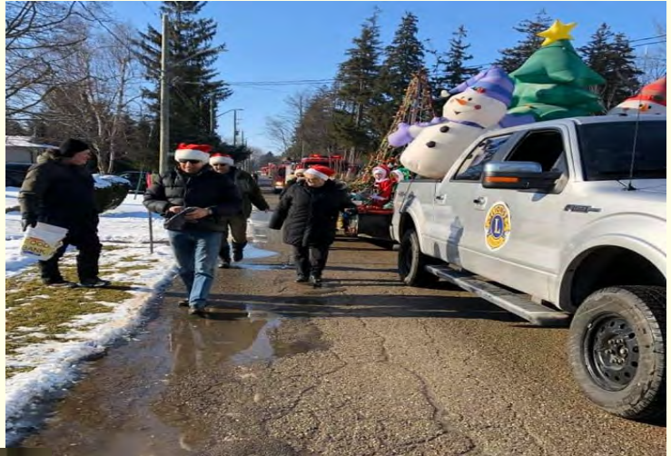
A beautiful day for Paradise & District Lions float