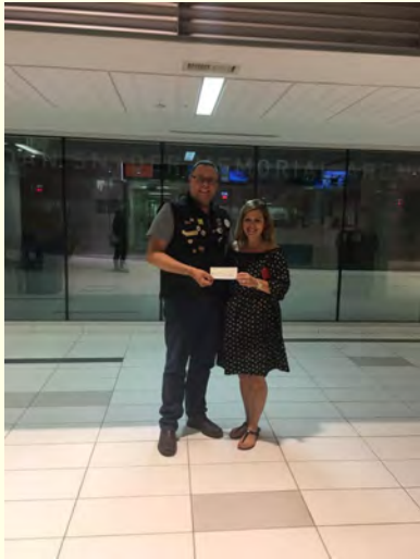
Breslau Lions donated money towards the shelter at Breslau Memorial Park.