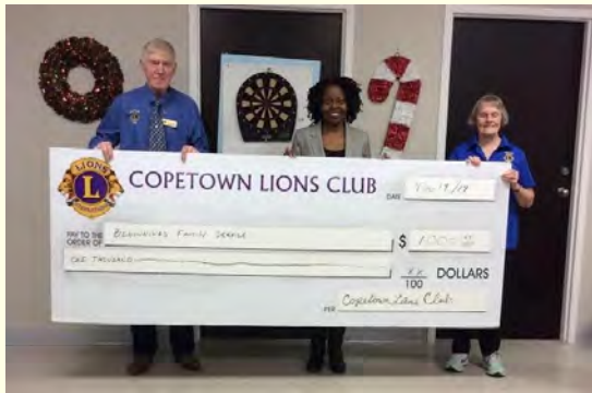
Copetown Lions donate $1,000 to Beginnings Family Services