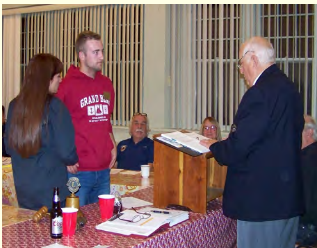
Sheffield & District Lions is growing with induction of new member