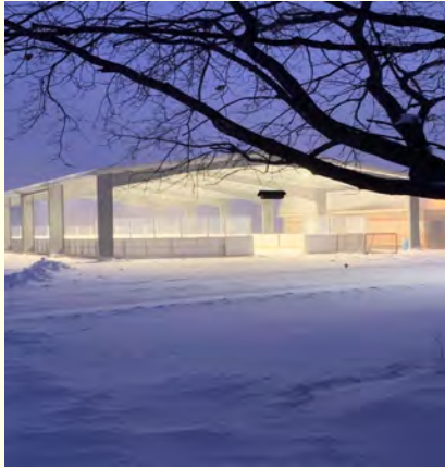
Atwood Lions Outdoor Skating Rink project completed—2019