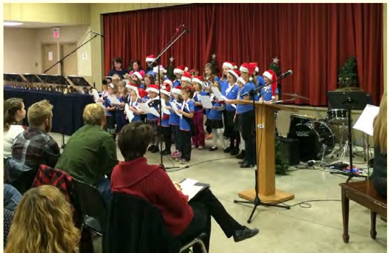
Thamesford Lions host a Christmas Carol Sing at Thamesford Arena Hall