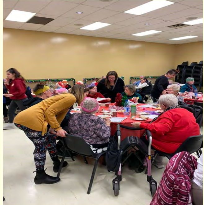
Here's a nice tradition - every year Lions Club of Kitchener (Ontario, Canada) hosts seniors who would not otherwise have a chance to celebrate the season . We open the hall to Seniors from our community who might not normally be able to get out for Christmas.