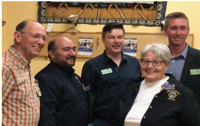
Cambridge Highlands Lions Club donates $10,000 to the community.