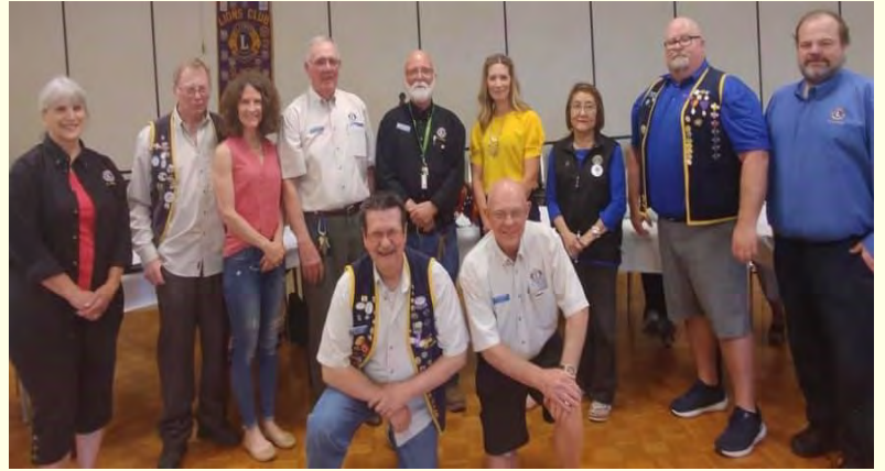
St. Jacobs Lions Executive for 2019-2020