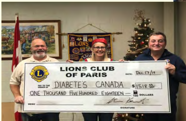
Our club was thrilled to present a donation to Diabetes Canada, thanks to the hard work of our members and to the many Paris residents who have donated to our bottle drives this year.