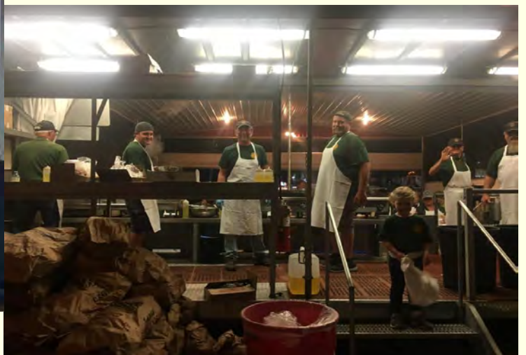
Rockton Lions serving it up at the Rockton World's Fair