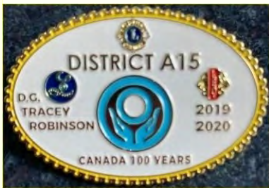
District A 15 - 2019-2020

As with anything that Lions are involved in, fun and fellowship leads to service. In 2008, the Lions International Trading Pin Club led a fundraising effort among fellow pin traders and presented a check for US$100,000 to Campaign SightFirst II at the International Convention in Minneapolis the following year.