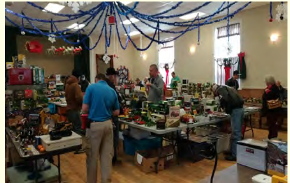
Belwood Lions held their 5th Annual Farm Toy & Collectible Show & Sale on Saturday 7 Feb