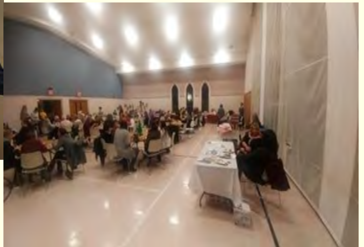
Plattsville & District Lions host Ladies Day Out