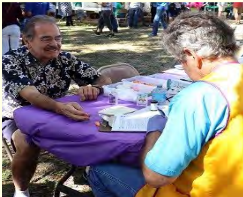
Lions Battle Diabetes With Awareness and Education