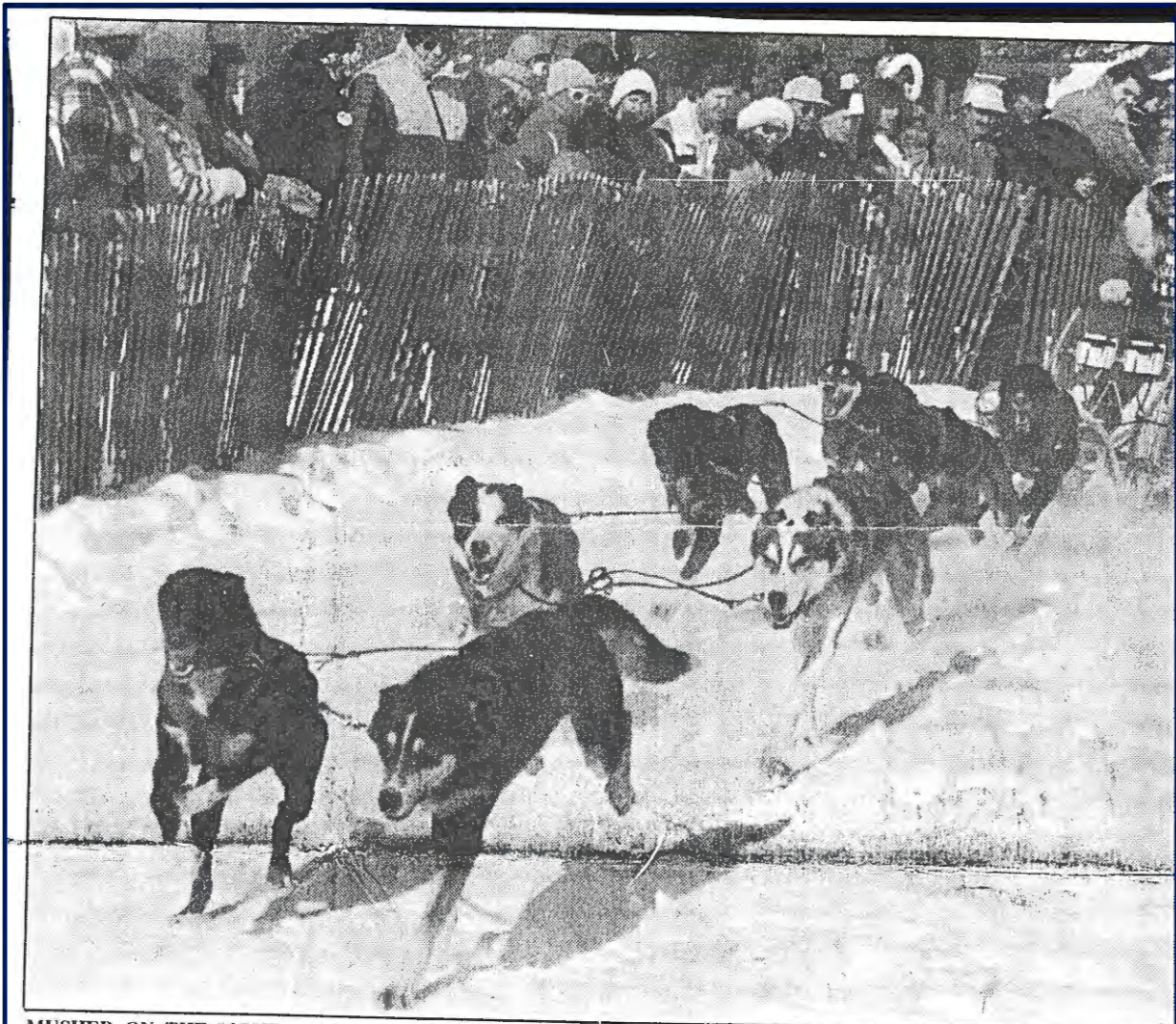
MUSHER ON THE MOVE —The pace was fast at the second annual Atwood Lions Club Sled Dog Derby and Trade Show which attracted over 60 participants. Over the two-days about 6,000 spectators watched as ers shot out of the race chute.