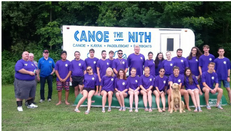
2017 Youth Exchange group New Hamburg Lions provided breakfast and the opportunity to Canoe the Nith.