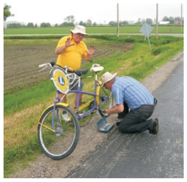
Riding for Cancer

"I trust that your club will consider the matter and respond positively through the district treasurer. Please ensure your donation is directed to "CNIB- Lake Joe".