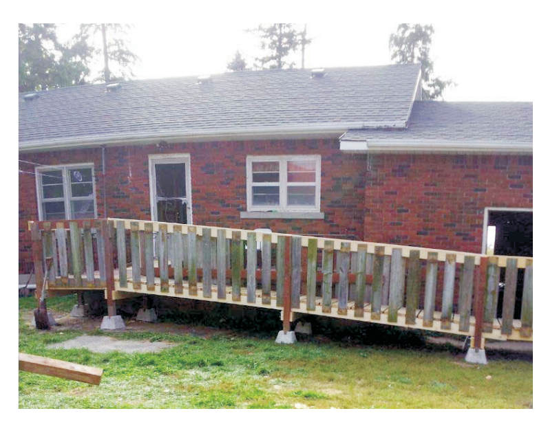
The 70-foot ramp built by Sweaburg Lions.

The new materials cost almost $1,100. Our Club donated $400, the lady where we built the 43 foot ramp donated an additional $300, and the drivers from Noblewood Milk Transport donated $420. The ramp was completed in a day and the patient has been getting outside and enjoying life a little more.