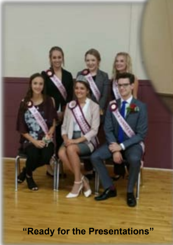
"Ready for the Presentations"