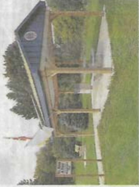
enactment / observation

The Hickson Parkette includes a shelter, picnic table, garbage can, trees and a bench. Lighting is solar powered and the sign