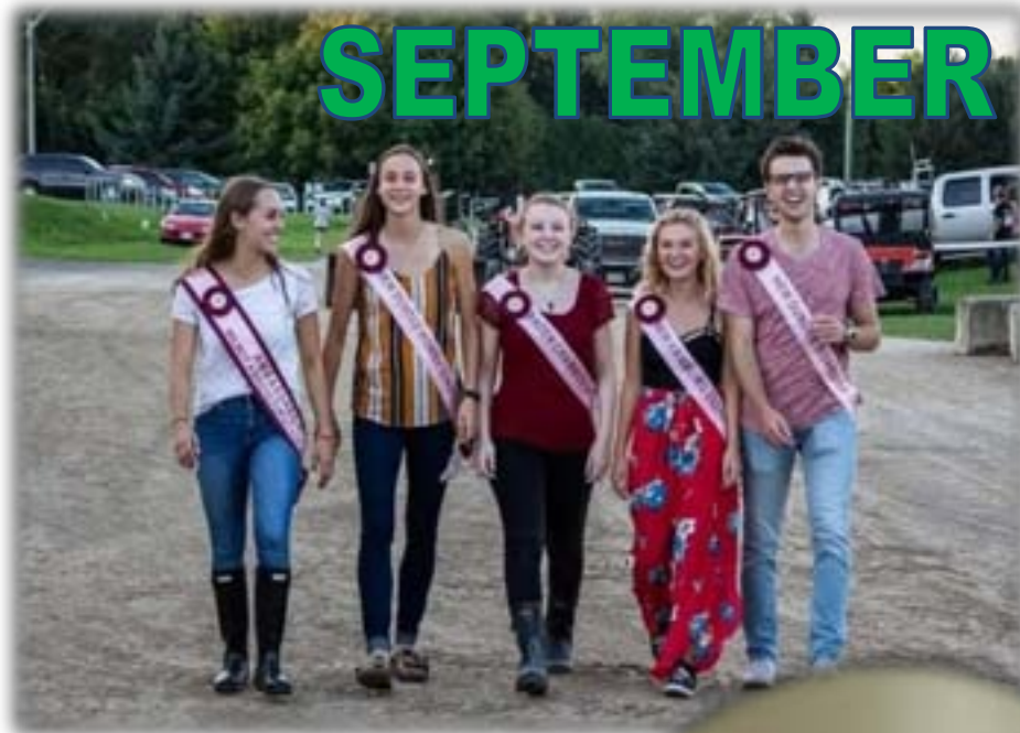
Celebrating and having fun together