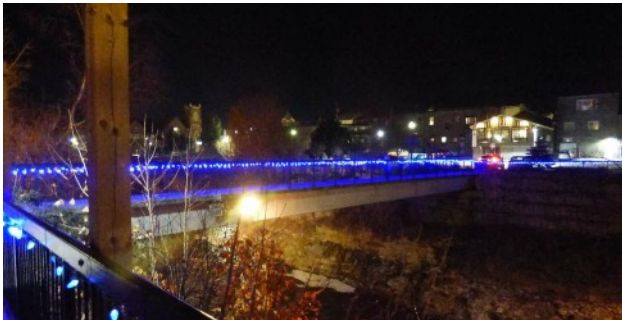
Bridge after the lighting ceremony

In all, both campaigns saw 23 Lions of the Club provide 43 hours of Service to promote Diabetes Awareness.