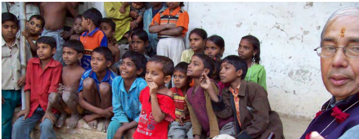
(Lion O.P. with the school children)