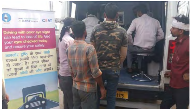
Free Eye Screening of Truck Drivers, U.P. Delhi transport, 2017