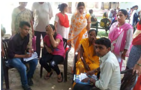
Nankari Camp, Kanpur - August 10, 2017