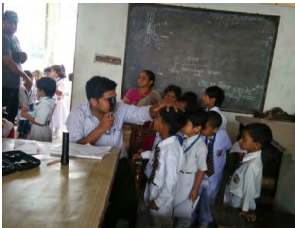
Free Eye Screening of School Children, Jajmau, Kanpur September, 2017

The Guelph Lions Club continued to forward support for the operations of the Sushila Devi Hospital for several more years. Today the Sushila Devi Eye Hospital continues with cataract surgeries, other eye treatments and care of patients; as well as providing many free eye screening camps and eye clinics in other rural areas of India annually.