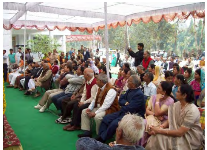
( hospital and crowd at the opening ceremony)