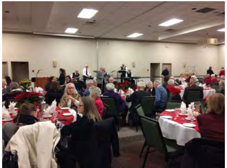
Guelph LC CNIB dinner