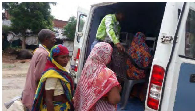
Patients leaving Rambagh Park Surgical Camp, Kanpur – August 20, 2017