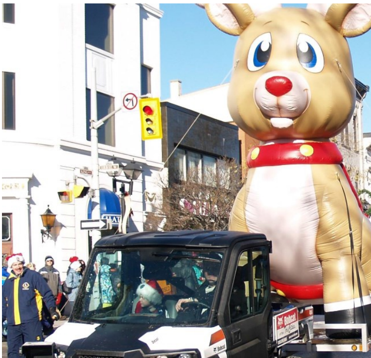
A special appearance by Rudolf and his Red Nose!