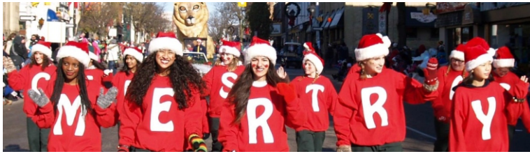
A bevy of beauties offer a Christmas greeting to parade-goers.