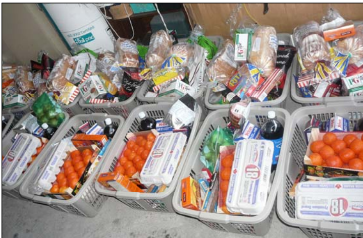
Turkeys, and all good things to give a family a truly festive Christmas holiday!